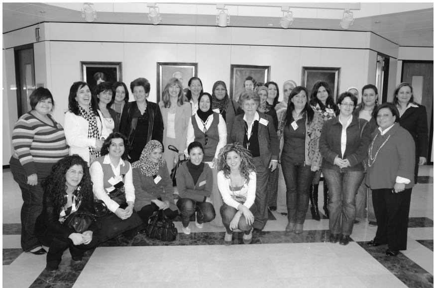
Group picture of the participants in the workshop.