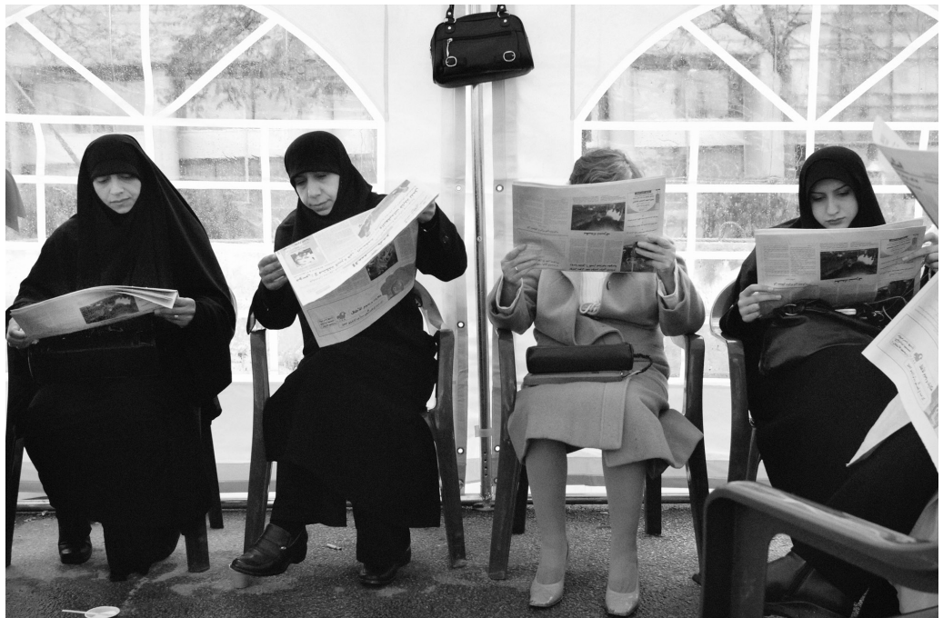
Newspapers, Beirut 2007.

up for this shortcoming by the questions they raise, the insights they contribute, and the objective assessments they provide.