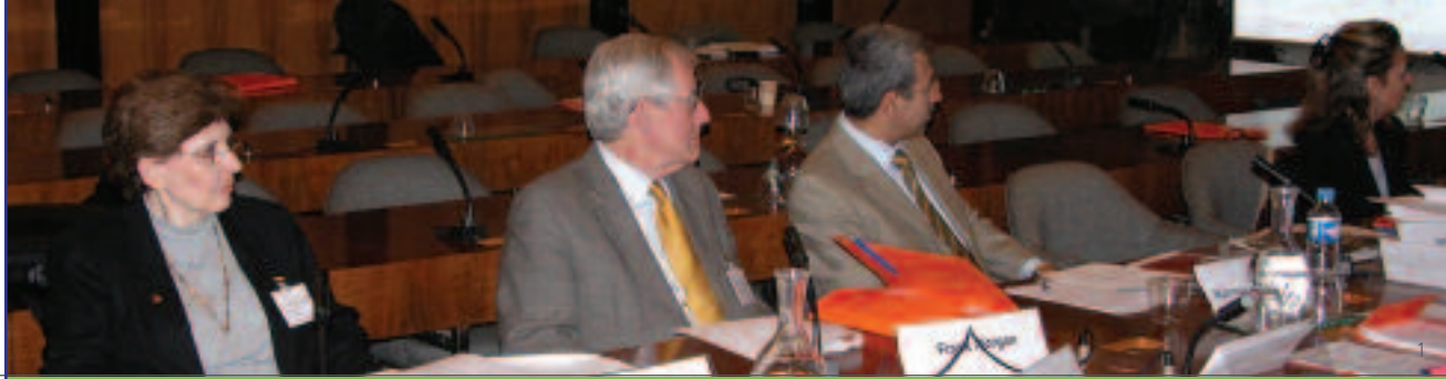
1 IPJ director (L) at "Experts Consultative Meeting on Journalism Education" organized by UNESCO in Paris