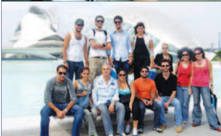
4 Byblos Architecture and Design students in front of the work of Spanish architect Calatrava...