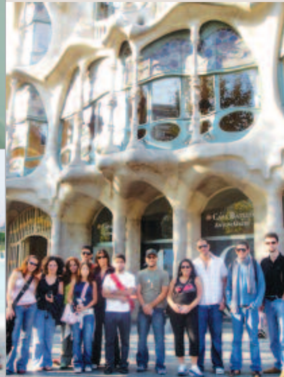
5 ...and before a characteristic Gaudi creation