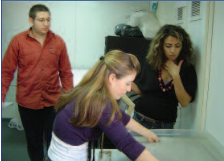
3 Graphic Design students at the Kufi workshop in Beirut