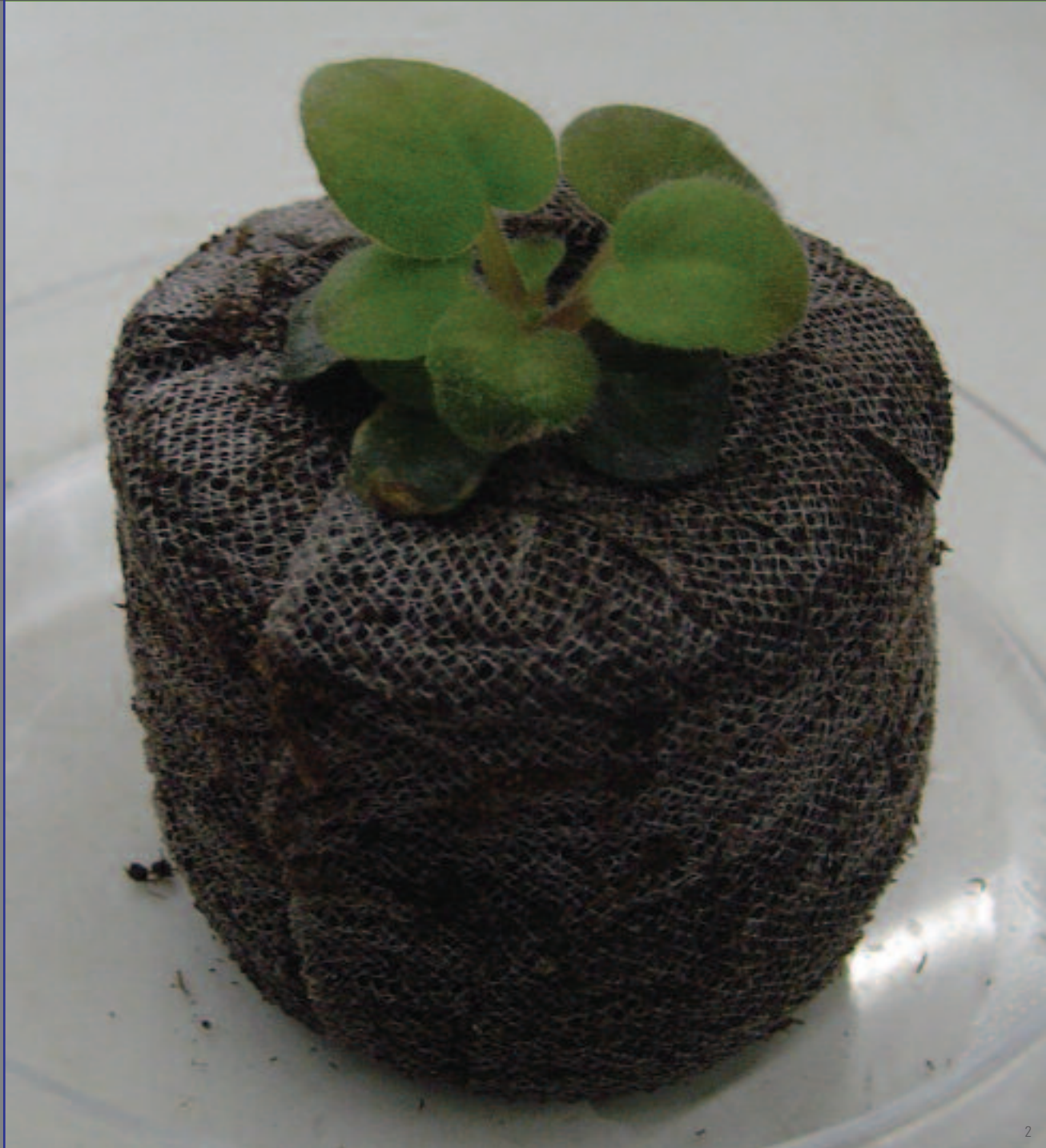
2 Science and mass cul- ture meet at LAU – waiting for future beauty to grow