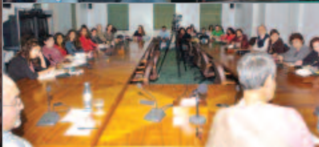
8 November 18: A view of the Spivak Seminar