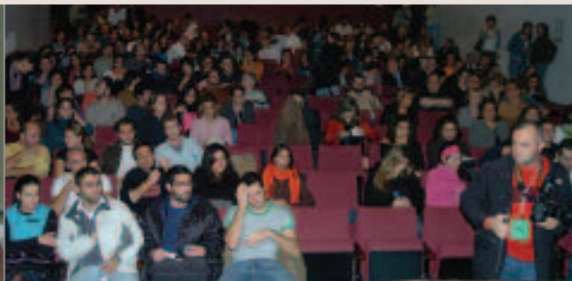
7 November 17: Irwin Auditorium filling up for Gayatri Spivak