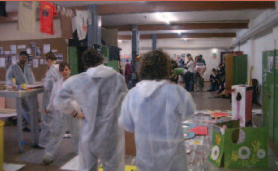
6-7 Graphic Design students at the Bremen workshop