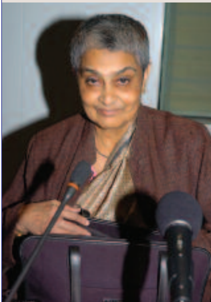
6 Professor Gayatri Spivak at the Humanities/Comparative Literature lecture